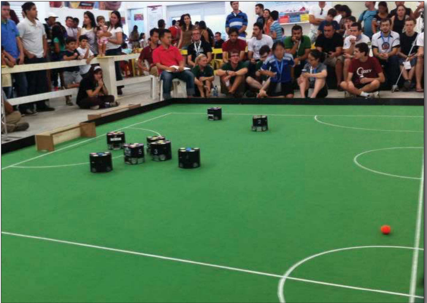
Figure 2. The Small Size League.