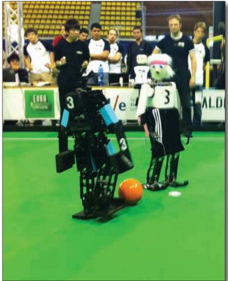
Figure 5. Humanoid TeenSize League.

Speed and robustness of robot locomotion and speed and power of kicking have been important differentiators in this league. Teams with fast-moving robots have a large advantage. However, strategy and teamwork, including where to kick the ball, and where robots without the ball should position themselves, have also played important roles.