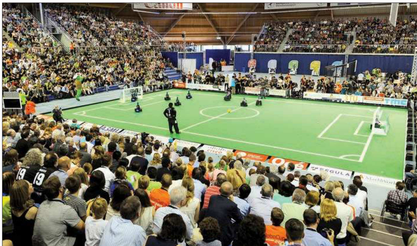
Figure 3. The Middle Size League.

Robot hardware design is still a challenge, because of the size restrictions and of the new sensing capabilities that become possible on-board the robots. Nonetheless, perception is essentially solved by the external vision system, thus the scientific focus of the Small Size League is on robot control: the speed of the robots as well as of the ball is very fast; moreover, the capabilities of the players in dribbling, interception, and shooting are remarkable, and typically achieved through machine-learning approaches. However, the teams compete mostly at the strategic level, using positioning, passing, and high-level decision making. Sequences of multiple passes and complex plays have become commonplace. Machine learning is applied also in many high-level tasks: a unique example of learning the opponents' behaviors and strategies in real robot systems has been shown in this league.